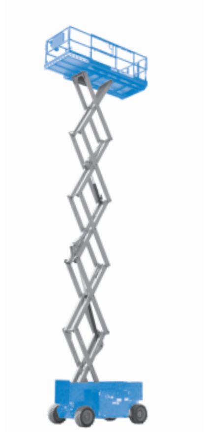
01/18 Part No. B127292UK